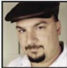
Anthony Zuiker Creator of CSI